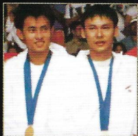
Chandra Wijaya/ Tony Gunawan (INA) 2000 / Doubles Gold Medalists