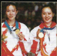
Ge Fei/ Gu Jun (CHN) 2000 / Doubles Gold Medalists