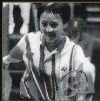
Gong Zhichao (CHN) 2000 / Singles Gold Medalist