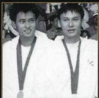
Chandra Wijaya/ Tony Gunawan (INA) 2000 / Doubles Gold Medalists