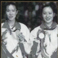
Ge Fei/ Gu Jun (CHN) 2000 / Doubles Gold Medalists