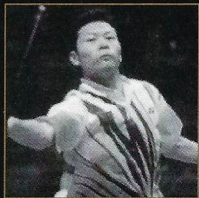
Ji Xinpeng (CHN) 2000 / Singles Gold Medalist