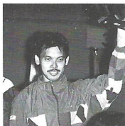
RAZIF SIDEK - Malaysia Men's Doubles Champion