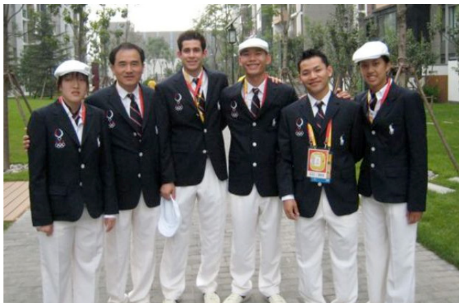
2008 | Beijing