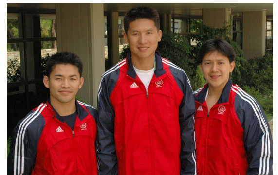
2004 | Athens