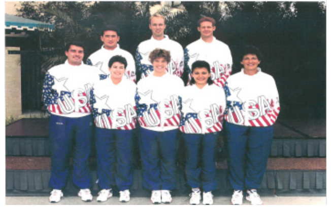
1992 | Barcelona

The first United States Olympic Badminton Team in 1992 consisted of its top six athletes -- three men and three women. In 1996, the USA Badminton was represented by five athletes, followed by one in 2000 and two in 2004. In 2016, the United States qualified its largest team ever (7) and for the first time, will compete in all five disciplines.