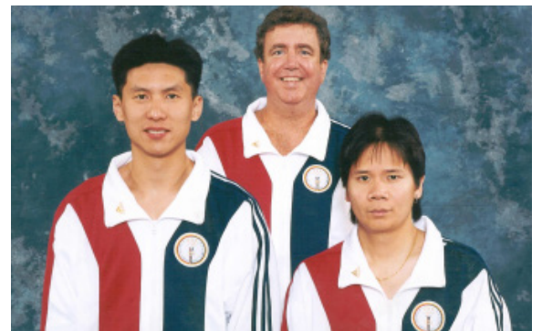
2000 | Sydney