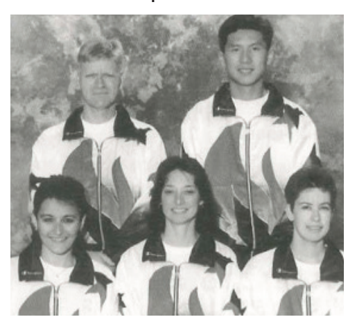
1996 | Atlanta