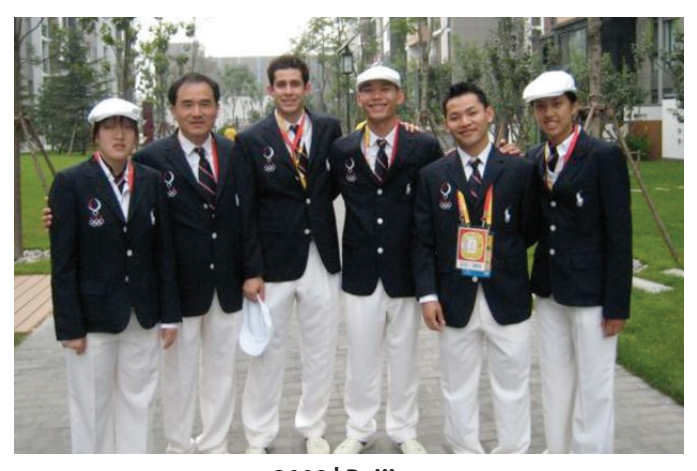
2008 | Beijing

The first United States Olympic Badminton Team in 1992 consisted of its top six athletes -- three men and three women. In 1996, the USA Badminton was represented by five athletes, followed by one in 2000 and two in 2004. In 2008 the U.S. looks to qualify in each discipline, a first for the U.S. in a Games held outside the U.S.