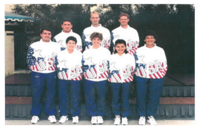
1992 | Barcelona