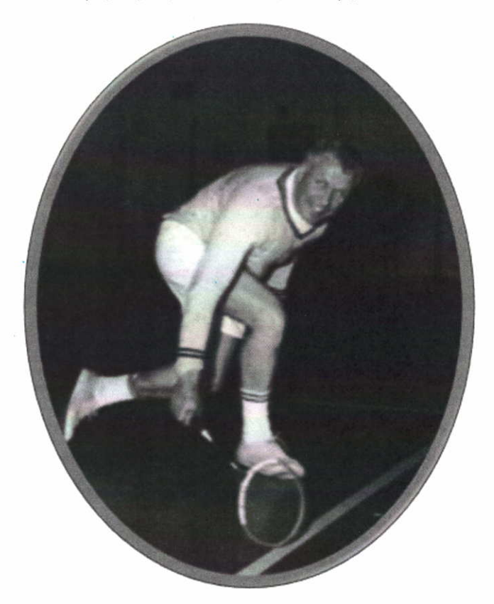
"Forever in Our Hearts"