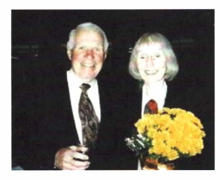
"Forever and Always!"

"Grab some ice cream and come sit for awhile"