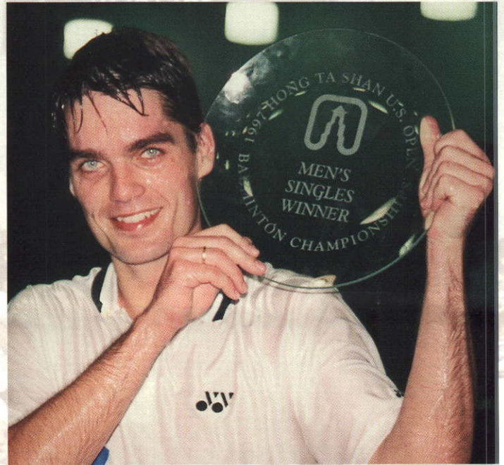
MEN'S SINGLES CHAMPION POUL-ERIK HOYER-LARSEN (DENMARK) REGAINED HIS '96 OLYMPIC GOLD MEDAL FORM

MIXED DOUBLES - KIM DONG MOON/KYUNG MIN RA (KOR) defeated BAMBANG SUPRIANTO/ROSALINA RISEU (INA) 15-1, 15-3.