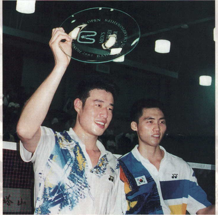
MEN'S DOUBLES CHAMPION KIM DONG MOON/TAE KWAN HA (KOREA)