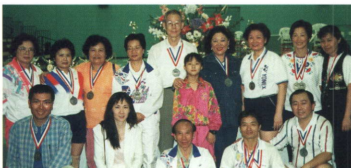
SPECIAL GUESTS FROM TAIWAN PARTICIPATING IN THE OCBC SENIOR INTERNATIONAL TOOK HOME THEIR FAIR SHARE OF OCBC MEDALS.