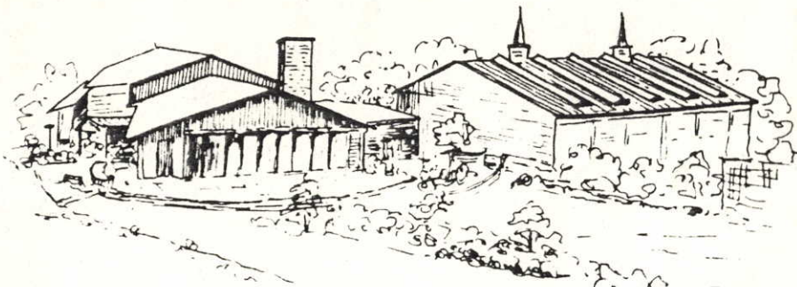
THE AUDITORIUM & MELLON GYMNASIUM