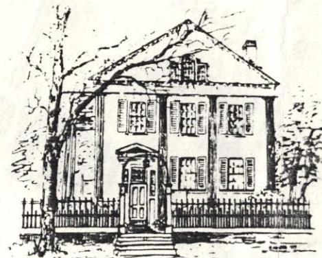
THE HUMPHREY HOUSE

Participants will attend coaching sessions, selected classes and may be required to teach at the end of the session.