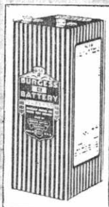
One of several sizes of Vertical 'B' Batteries.