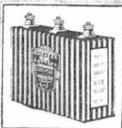
Burgess 'C' Batteries improve reception economically.