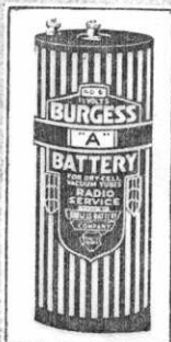
Standard Burgess Radio No. 6 'A' Battery "Over Twice the Life."